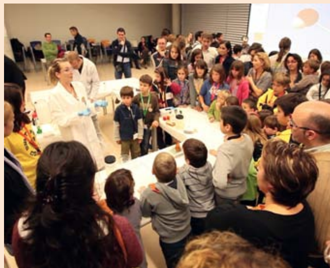
Participants in ICIQ's workshop in Chemistry.

Science Week at ICIQ: As it has become a tradition, last November ICIQ organised several activities in the frame of the 2010 Science Week in order to get Chemistry closer to Society. Throughout a week ICIQ offered guided tours to ICIQ facilities, a workshop in Chemistry (“Familiar Chemistry”) and fun experiments at the R&D Fair from the URV.