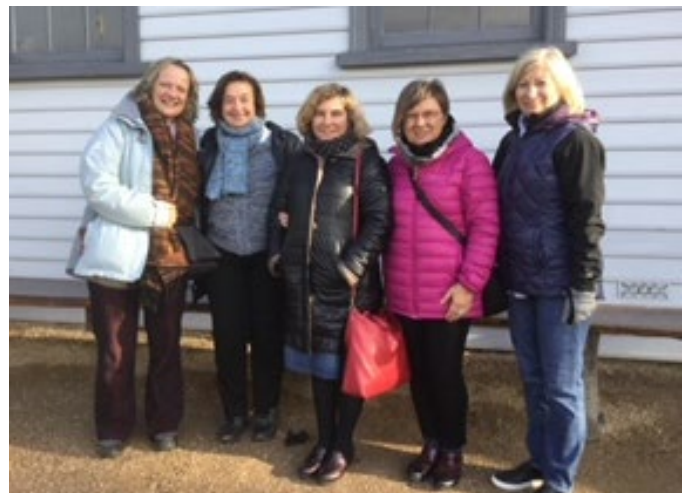
Photo: Melbourne conference delegates in Ballarat, Australia, 2018