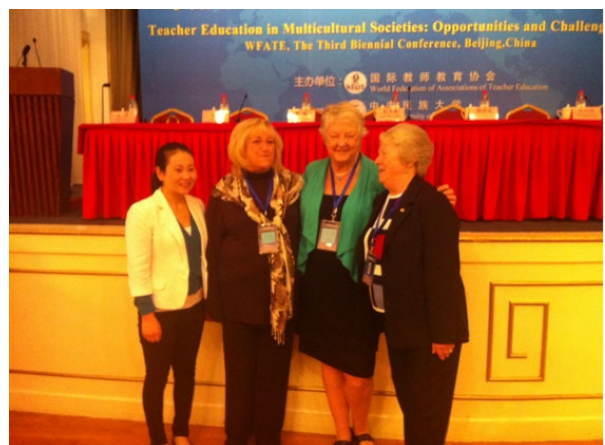
WFATE conference in Beijing in October 2014.